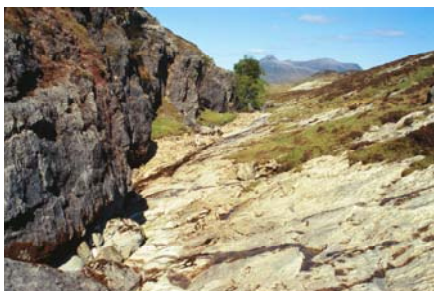
Traligill Thrust near Inchnadamph.**

Scotland is home to several classic geology sites where much of our understanding of geological processes was first developed. We'll begin our 12-day trip in Edinburgh, first spending two days exploring the city and the Southern Uplands. Then we'll drive northwest to the Glencoe area, with stops along the way to see the Highland Boundary Fault at Loch Lomond. After exploring the Glencoe volcanic caldera and Dalradian Precambrian metamorphics, we'll head west to the beautiful Isle of Skye, where we'll have a one-day driving tour and a one-day boat trip viewing remnants of volcanoes formed when Europe and North America split. We'll take the ferry back to the mainland and head north to Inchnadamph, visiting Knockan Crag along the way. We'll spend 2 days touring the north coast to see the Precambrian gneisses and sedimentary rocks of the Moine Thrust Belt, where the roots of the Caledonian Orogeny have been laid bare. (For more information about Scottish geology, a good website is www.scottishgeology.com .)