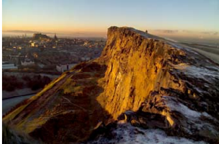
Salisbury Crags with Edinburgh beyond.**