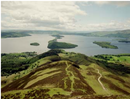
Loch Lomond from Conic Hill, near the Highland Boundary Fault.**