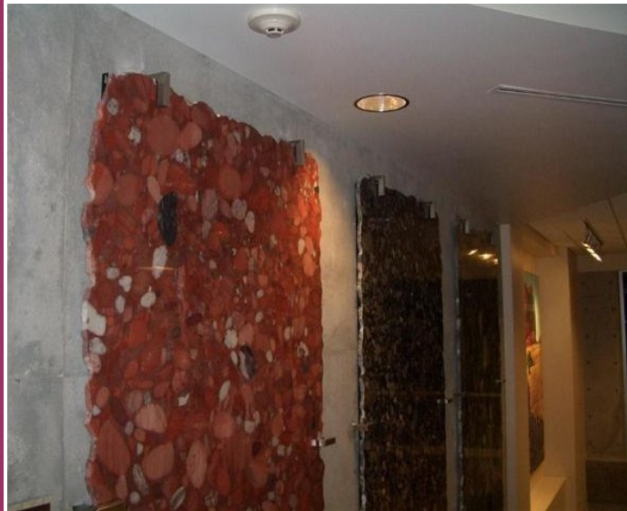
Slabs of Pre-Cambrian-aged conglomerate adorn the first floor of the building.