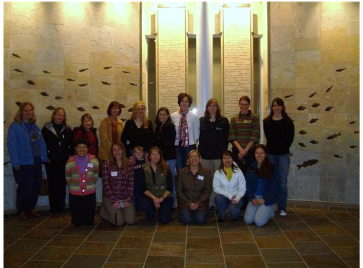
Our group poses in the main lobby of the Sutton Building in front of the Eocene-aged fish fossil wall.